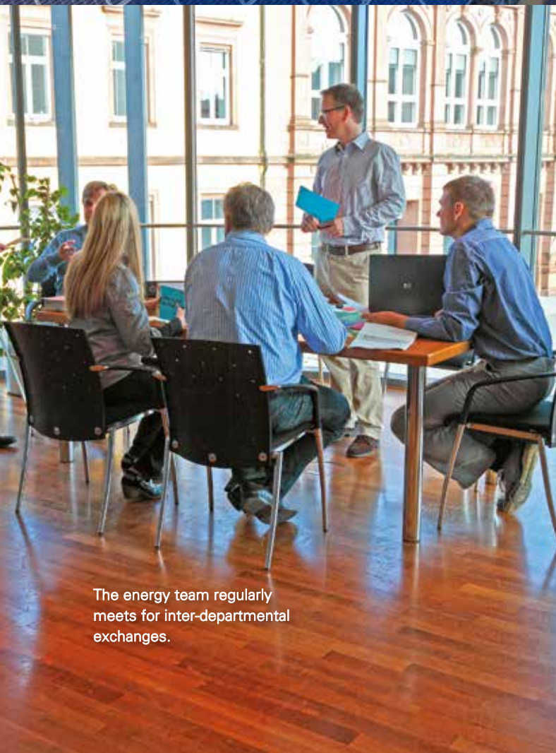
The energy team regularly meets for inter-departmental exchanges.