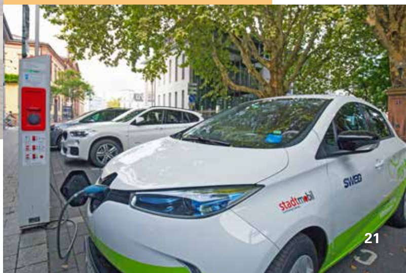
Car-sharing station for electric vehicles