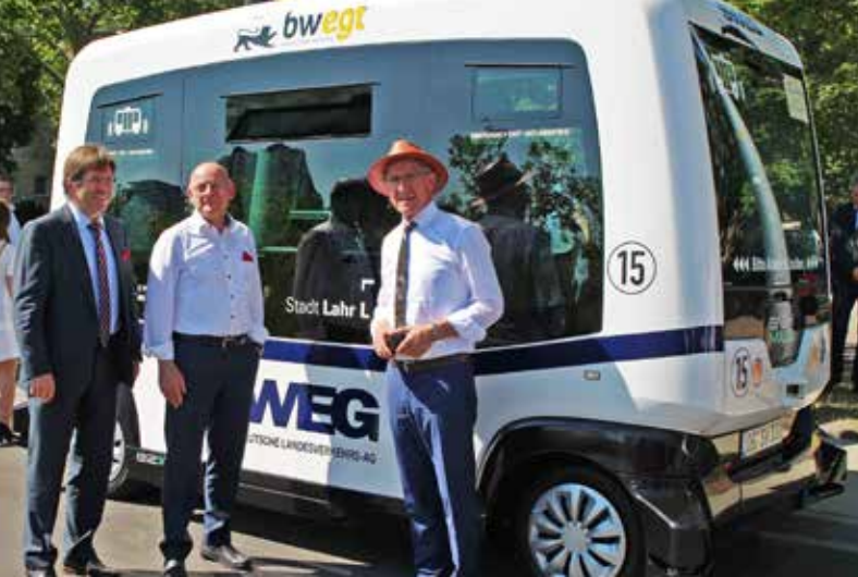
Pilot project: Self-driving minibus in Lahr