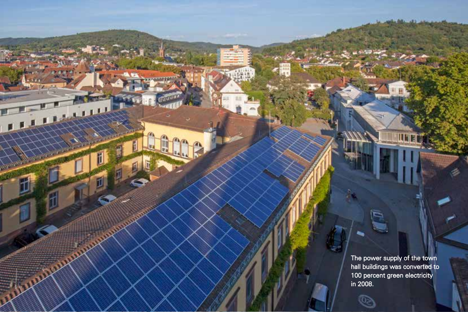
The power supply of the town hall buildings was converted to 100 percent green electricity in 2008.