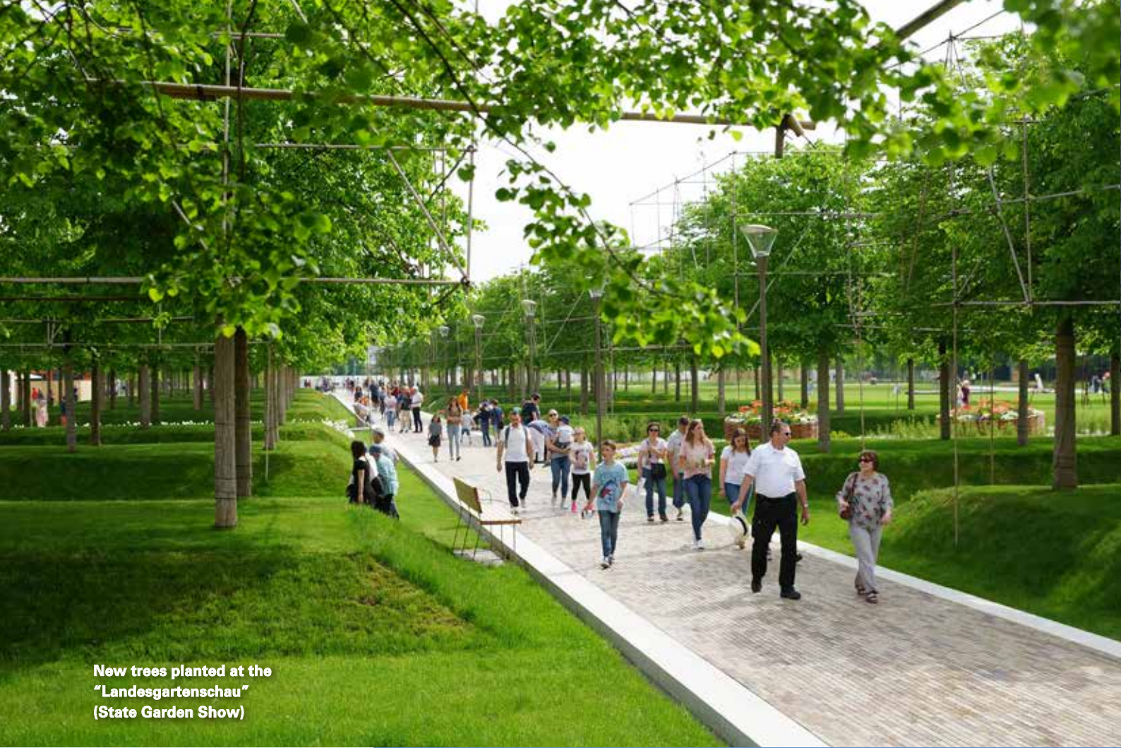
New trees planted at the "Landesgartenschau" (State Garden Show)