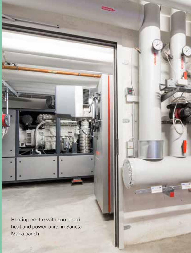
Heating centre with combined heat and power units in Sancta Maria parish