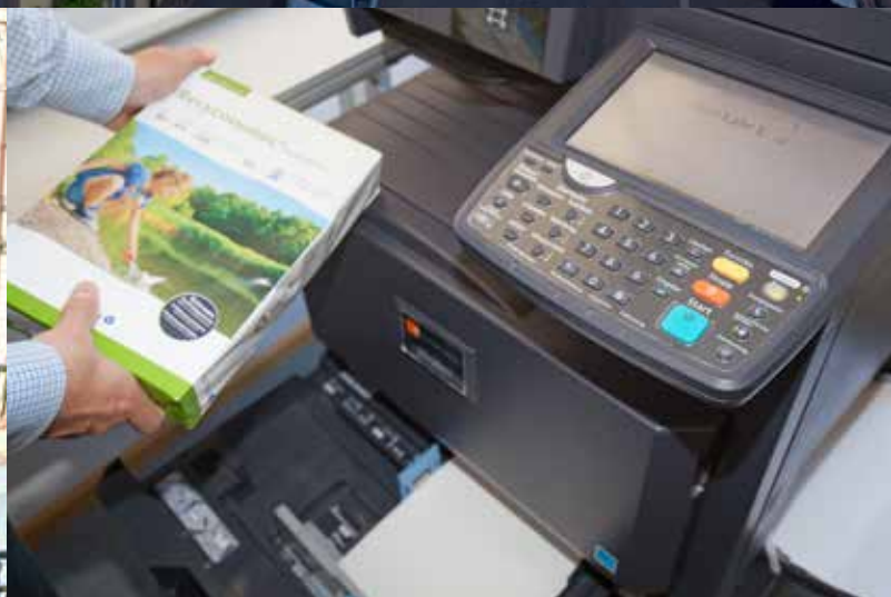
Recycled paper certified with the Blue Angel seal is used in the daily office work of the city administration.