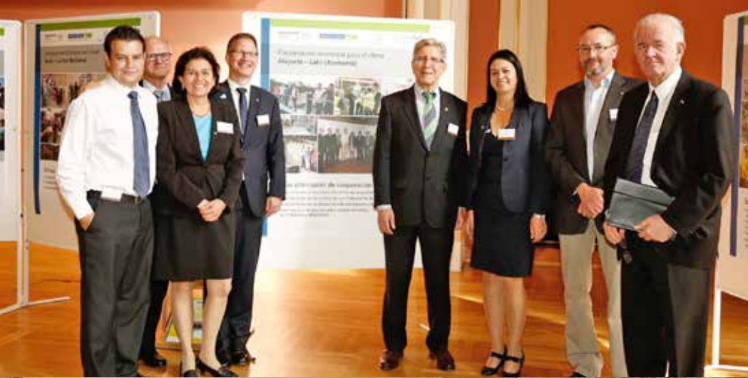
Town twinning and climate partnership in one: Lahr and Alajuela