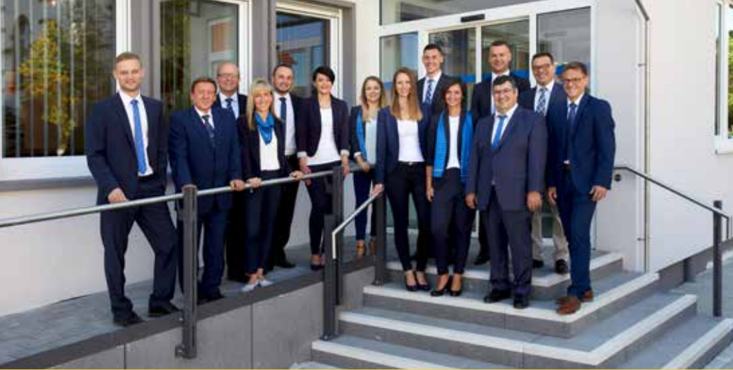
The team of Volksbank Competence Centre in Eisenbahnstraße