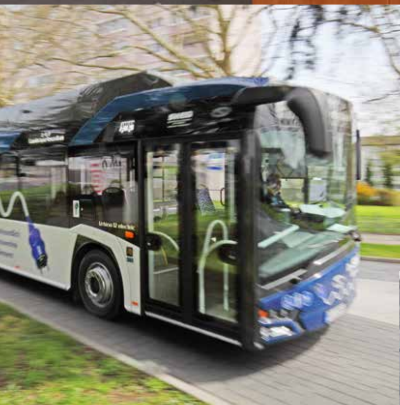
First fully electric public bus of SWEG in Lahr

The reconstruction of the railway station and the redevelopment of the Central Bus Station (ZOB) were completed in time for the State Garden Show in April 2018. Modern, accessible, and well designed, the new stations invite visitors to use public transport. Welcome to climate-friendly Lahr!