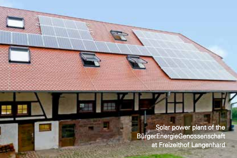
Solar power plant of the BürgerEnergieGenossenschaft at Freizeithof Langenhard